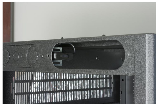
Hidden location behind knockout panel.

PROXIMITY SWITCH (Automatic on/off when presence is detected)