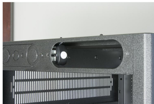
Hidden location behind knockout panel.