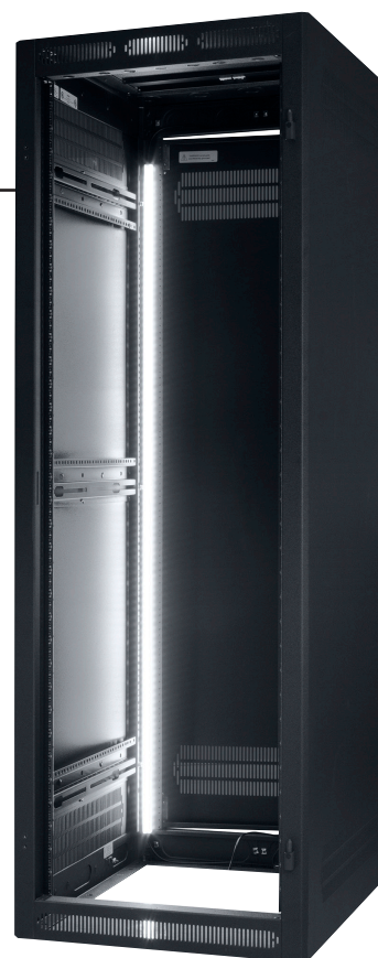
Model RLB-KIT-60 mounted in LER Series rack.