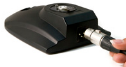
3-PIN XLRm OUTPUT