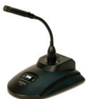
ATS WITH OPTIONAL MIC