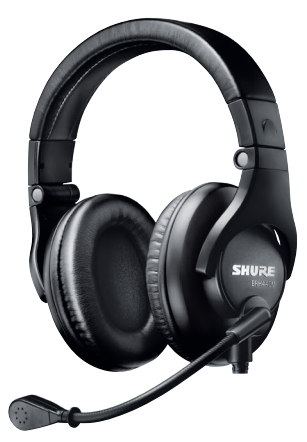
BRH440M Dual Sided Broadcast Headset