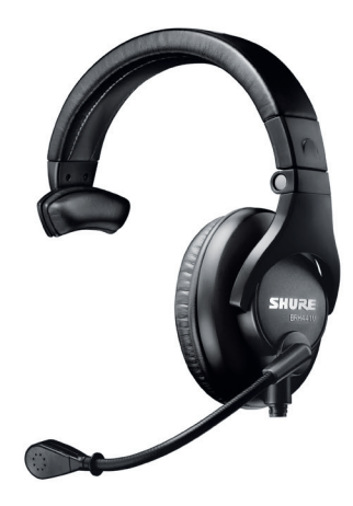
BRH441M Single-Sided Broadcast