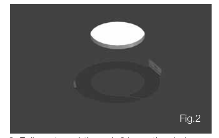
3. Follow steps 4 through 6 in section 4 above.

2. Cut out the hole in the ceiling using a pad saw following the broken line indicated on the template. Slide the C-ring into the ceiling, aligning it over the cut-out hole. (Fig. 2)