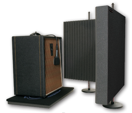
DeskMAX<sup>™</sup> shown here with an amp on a GRAMMA<sup>®</sup>

The pair of 24"x24"x3" Studiofoam® panels mount to the included desktop stands and can be used to tame unwanted signal bleed on-stage or in the studio.