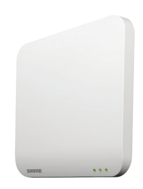
MXWAPT Access Point Transceiver