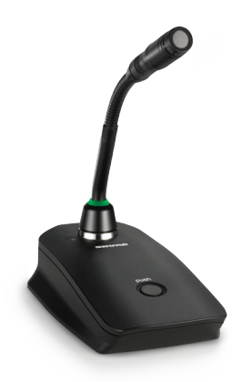
MXW8 Gooseneck Base Transmitter