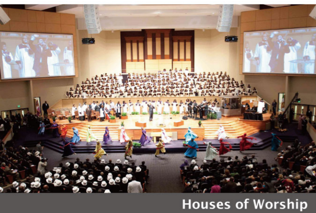
Houses of Worship

Digitally encrypted technology enables secure audio transmission, preventing unauthorized listening. Digital design provides crystal-clear audio quality, interference-free from Bluetooth, Wi-Fi and 2.4GHz wireless transmission and unmatched by the deficiency of simple analog design systems. Digital technology ensures every word can be heard clearly especially at places with noisy environments.