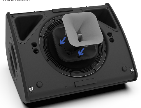
Grill removed, an additional magnetic flange can be quickly fitted to change directivity from 60x60 to 90x40

The phase of the P12 setups is of course compatible with all other NEXO speakers and subs, except for the monitor setups where latency is minimized.