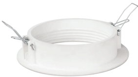
C3 Drywall Mounting Ring Kit