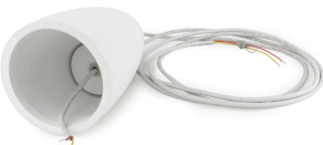
C3 Pendant Speaker Cover Kit with Wire and Safety Cable