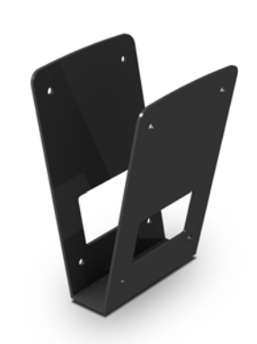
MASKCV-BL V-shaped 2-way cluster bracket for MASK4C(T)-BL/MASK6C (T)-BL