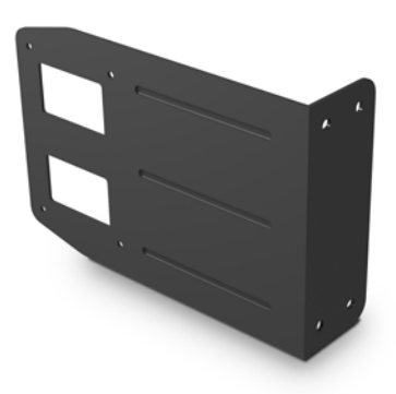
MASKCV-BL V-shaped 2-way cluster bracket for MASK4C(T)-BL/MASK6C (T)-BL

MASKCL-BL L-shaped side bracket for MASK4C(T)-BL / MASK6C(T)-BL