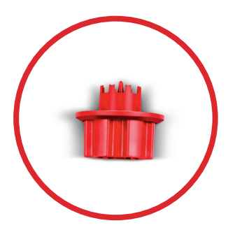
TCM-X Installation Tool