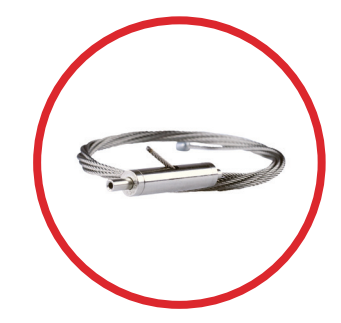
Seismic Cable Adapter