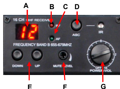
Wireless Speaker Transmitter-S1691T