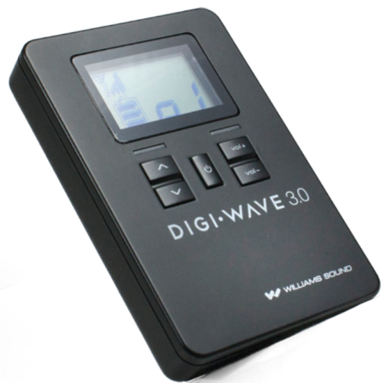
DLR 360 Receiver

The DLT 300 Transceiver features full-duplex capability, supporting up to four simultaneous talkers in two-way mode, and up to six simultaneous talkers in intercom mode. Slim, lightweight, and simple to set up and use. One- or two-way operation offers flexibility in an array of applications. With the push of a button, users can access two-way communication for immediate interaction or Q&A.