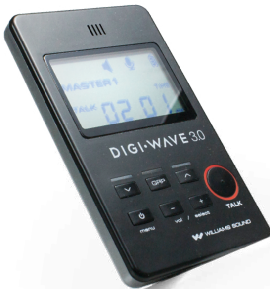
DLT 300 Transceiver