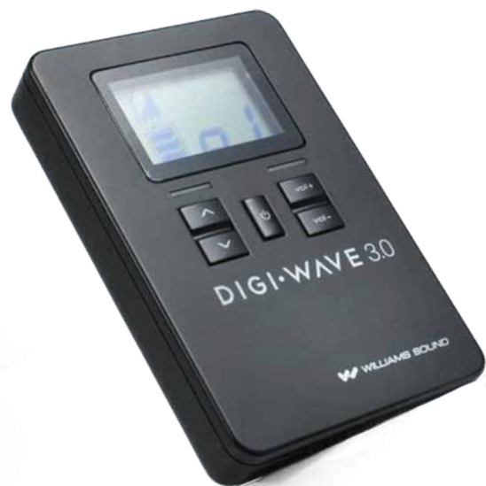
DLR 360 Receiver

The DLT 300 Transceiver features full-duplex capability, supporting up to four simultaneous talkers in two-way mode, and up to six simultaneous talkers in intercom mode. Slim, lightweight, and simple to set up and use. One- or two-way operation offers flexibility in an array of applications. With the push of a button, users can access two-way communication for immediate interaction or Q&A.