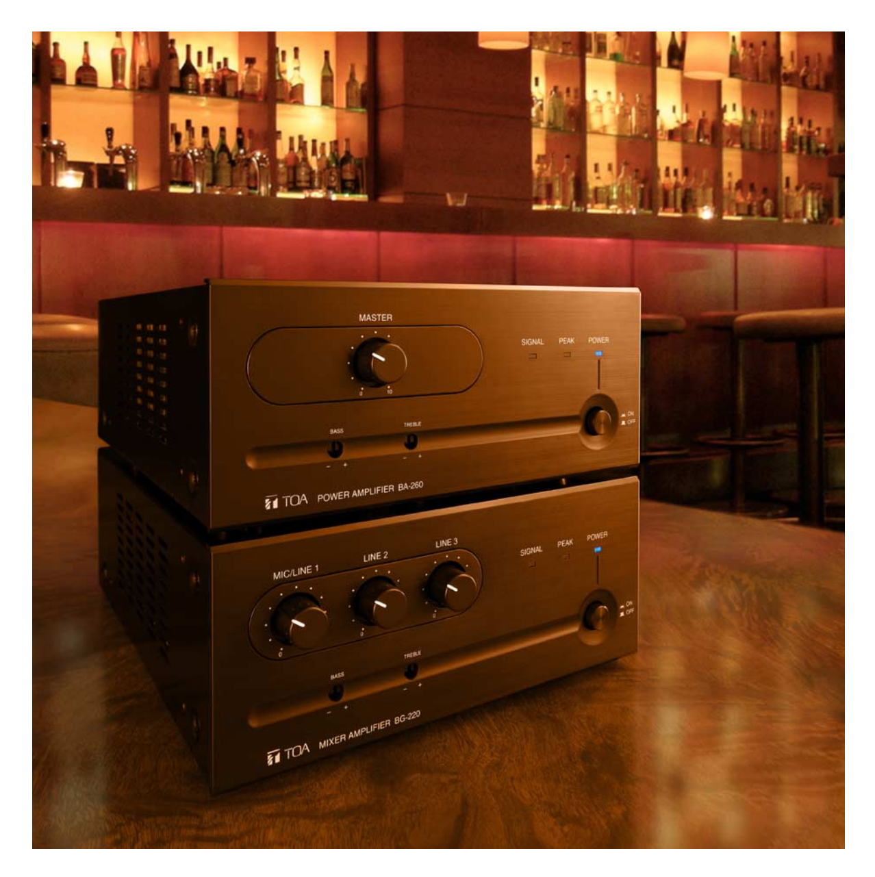
Introducing a new standard of excellence for BGM applications.