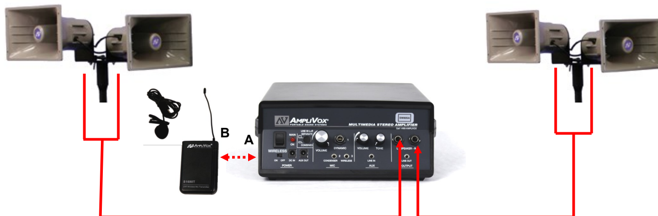
S1690T Microphone Transmitter