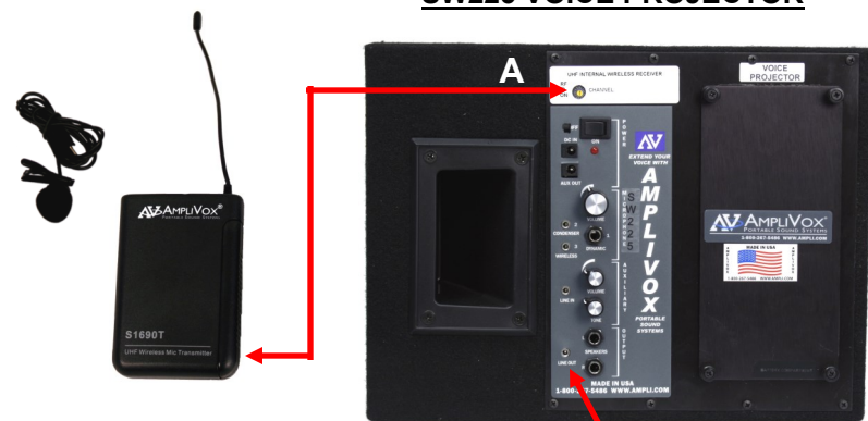
S1690T Microphone Transmitter

PLEASE NOTE: YOU HAVE TWO SEPARATE TRANSMITTERS. ONE IS FOR THE SPEAKER AND THE OTHER IS FOR THE MICROPHONE.