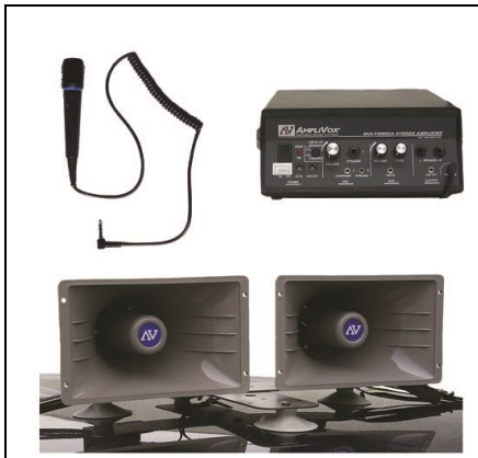
312 - 2 HORN SERIES