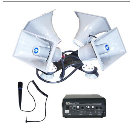
314 - 4 HORN SERIES

Thank you for choosing the S312, SW312, S314, SW314 Sound Cruiser Car Top PA System from AmpliVox Portable Sound Systems .