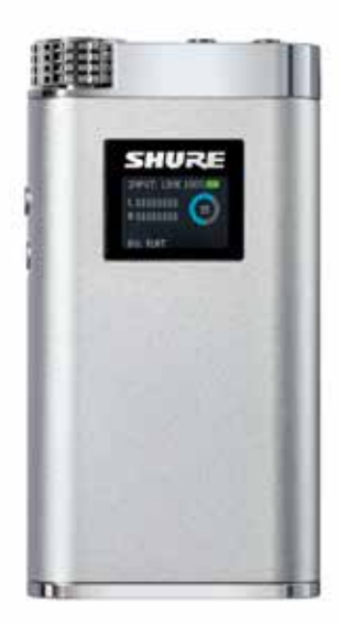
SHA900 Portable Listening Amplifier